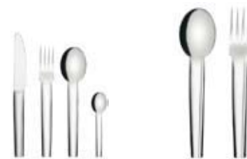
7340108 16-piece cutlery set