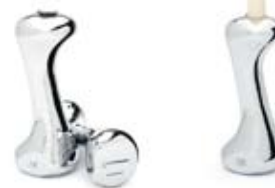
7340060 dumbell 2 kg